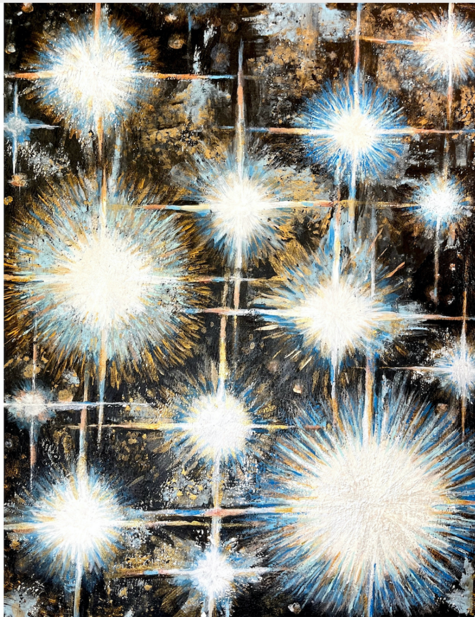
"Illuminations"

St. Augustine by-the-Sea with The Parish of St. Matthew