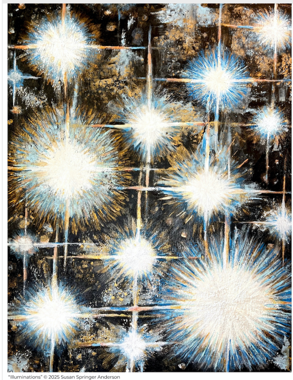
"Illuminations"

St. Augustine by-the-Sea with The Parish of St. Matthew